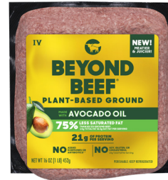
Beyond Meat Beyond Ground Beef