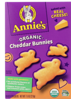
Annie's Organic Bunny Crackers selected varieties