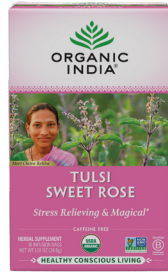
Organic India Organic Tulsi Tea selected varieties

Organic India was born from determination to restore depleted land with traditional and regenerative organic farming practices. When the soil flourishes, when gardens flourish, when farmers flourish—we all flourish.