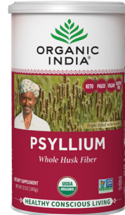
Organic India Organic Psyllium Husk