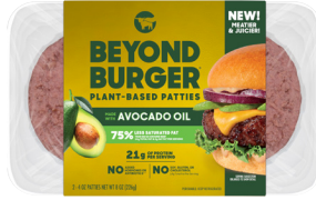
Beyond Meat Beyond Burger

The positive choices we make every day—no matter how small—can have a great impact on ourselves and the planet. At Beyond, we've taken the animal-based meal off the table, while still delivering the meaty, plant-based, better-for-you meals you crave.