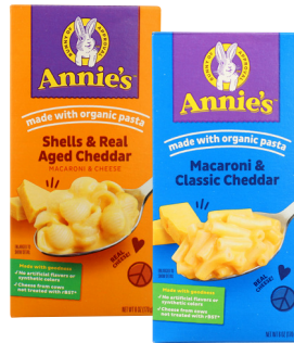
Annie's Mac & Cheese selected varieties