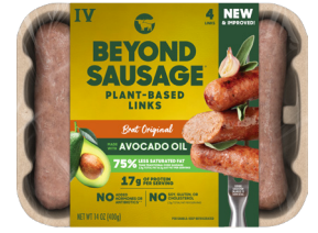
Beyond Meat Beyond Sausage selected varieties