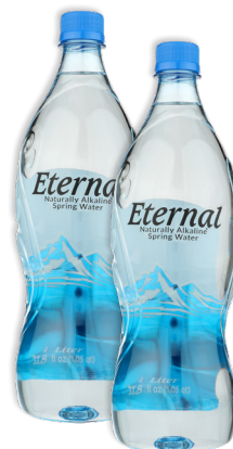
Eternal Naturally Alkaline Spring Water