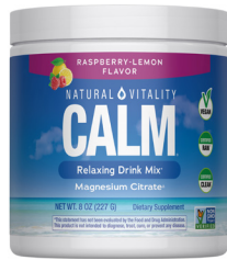
Natural Vitality Natural Calm selected varieties

Natural Vitality magnesium supplements have been a health ally since 1982. With a passion for natural health, we've been designing supplements that support natural vitality for over 40 years.