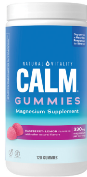
Natural Vitality Calm Gummies selected varieties