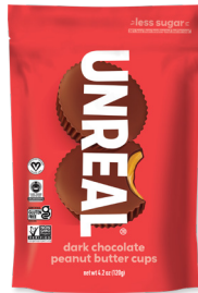
UNREAL Nut Butter Cups selected varieties