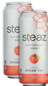
Steaz Organic Iced Green Tea selected varieties