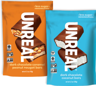
UNREAL Dark Chocolate Bars selected varieties