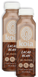
Koia Plant-Based Protein Shake selected varieties